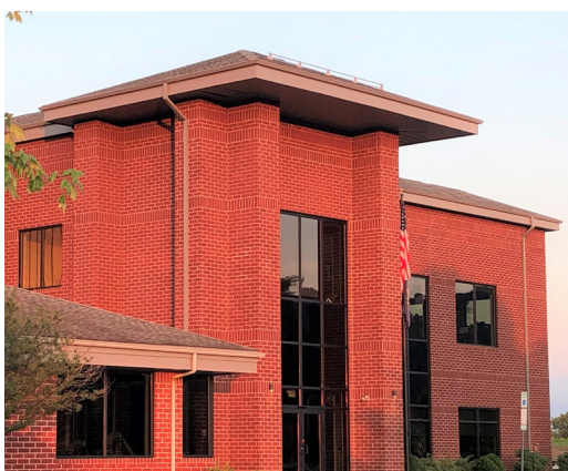
CCAP will be reopening its offices gradually.